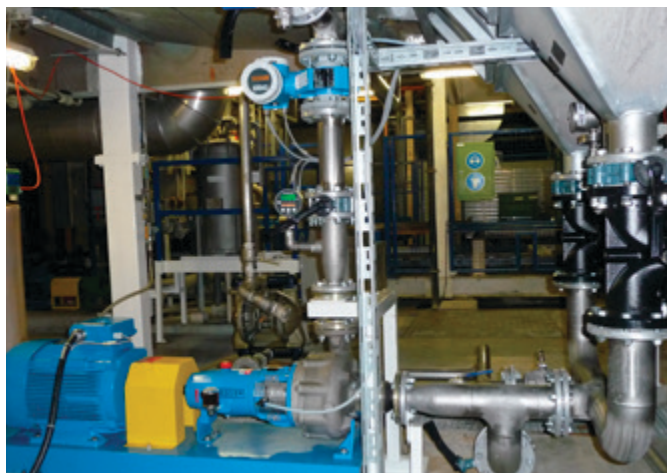
Figure 1: Filter press feeding with a horizontal Egger Turo® free-flow pump

Control concept using pump speed control Egger uses its Turo® free-flow pump with four-stage hydrodynamic shaft seal very successfully for such applications. The unique free-flow hydraulics with completely retracted impeller and a design without sealing gap guarantees gentle transport without any shearing or grinding of the delicate structures. In combination with a control con-